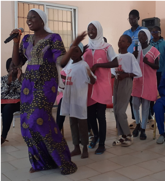
Express values through a dance / song. In this case the value was Harmony