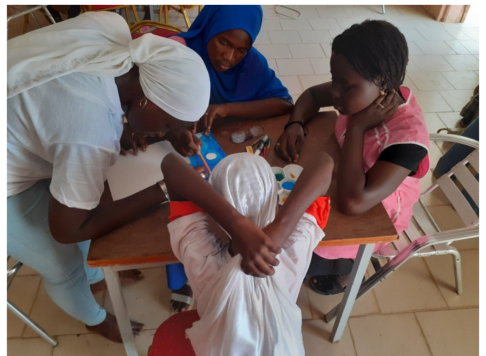
Young artists express their visions of a better world