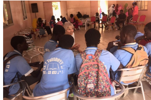
Discussion group - 'how can values be used to resolve our conflicts?'