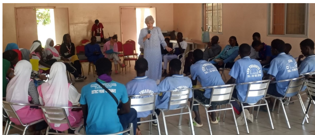
Students from Collège de Thiaroye - attentive, participative - the hope of the future