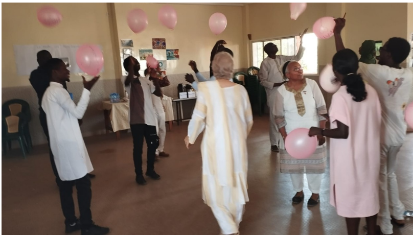
Energising activity – ‘Values Balloons’