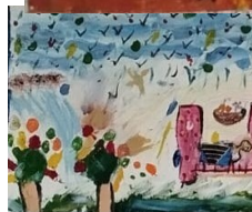
Visions of a Better World