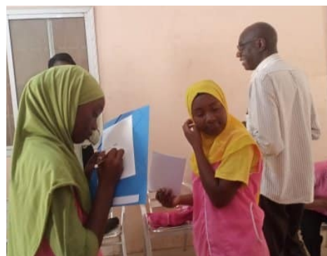
Introductions through a game 'my visiting card' – exchanging, observing and noting each others' values