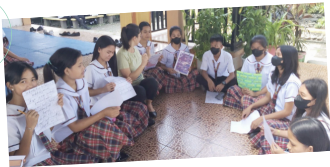
Values-based Atmosphere activities, Philippines