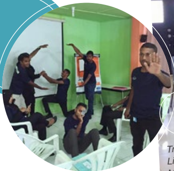
Training Police Officers to conduct Living Values Education activities, Maldives

The choice of values then becomes a conscious choice, one which can be explained by the head as well as being embraced and experienced by the heart.