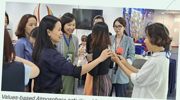
Values-based Atmosphere activities, Vietnam

"My Values-based Atmosphere defines who I am, what I stand for, my purpose, providing a continuous perspective of opportunity for change and growth."