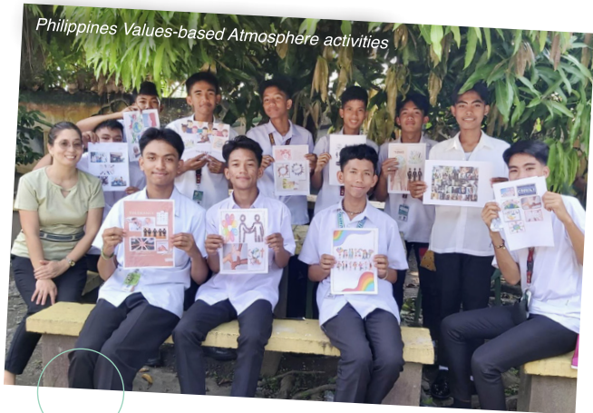
Philippines Values-based Atmosphere activities

Join Living Values Education International and become the opportunity to be a positive force for good and for the expansion of Love in the world.