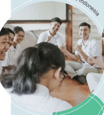
Yowana Kreatif Project, Indonesia