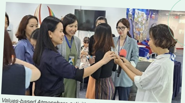
Values-based Atmosphere activities, Vietnam

"My Values-based Atmosphere defines who I am, what I stand for, my purpose, providing a continuous perspective of opportunity for change and growth."