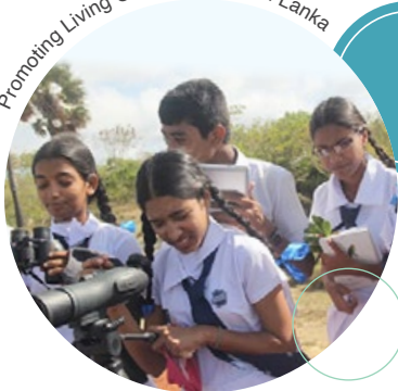
Promoting Living Green Values, Sri Lanka