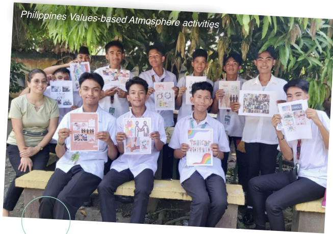
Philippines Values-based Atmosphere activities

Join Living Values Education International and become the opportunity to be a positive force for good and for the expansion of Love in the world.