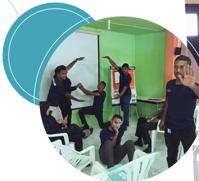
Training Police Officers to conduct Living Values Education activities, Maldives

The choice of values then becomes a conscious choice, one which can be explained by the head as well as being embraced and experienced by the heart.