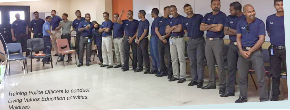
Training Police Officers to conduct Living Values Education activities, Maldives