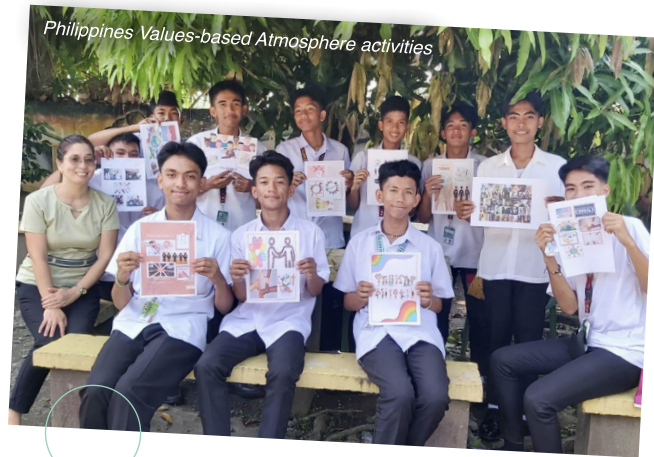
Philippines Values-based Atmosphere activities

Join Living Values Education International and become the opportunity to be a positive force for good and for the expansion of Love in the world.