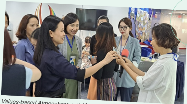
Values-based Atmosphere activities, Vietnam

"My Values-based Atmosphere defines who I am, what I stand for, my purpose, providing a continuous perspective of opportunity for change and growth."