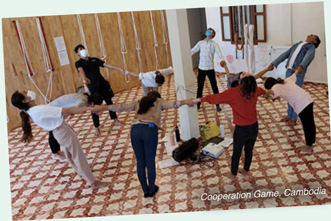
Cooperation Game, Cambodia

For many people concerned about values, it's apparent that talking about values is important, but not enough.