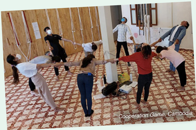
Cooperation Game, Cambodia

For many people concerned about values, it's apparent that talking about values is important, but not enough.