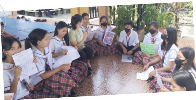
Values-based Atmosphere activities, Philippines

~ "I demonstrate my Values-based Atmosphere in every moment, for it emanates from within me. It is felt by every person, my family, friends, all people, animals, and every living thing. It is fully visible in my environment." ~