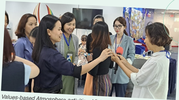
Values-based Atmosphere activities, Vietnam

"My Values-based Atmosphere defines who I am, what I stand for, my purpose, providing a continuous perspective of opportunity for change and growth."