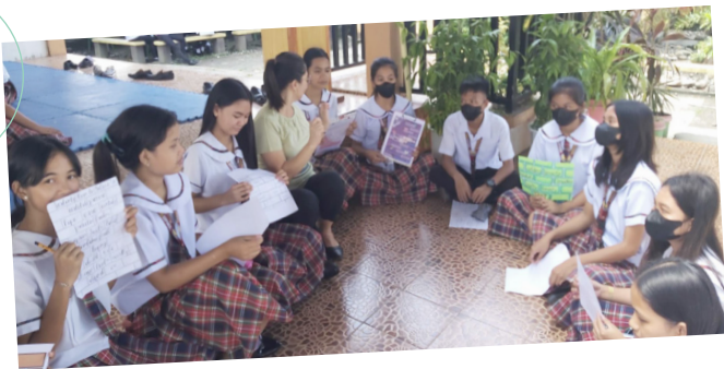
Values-based Atmosphere activities, Philippines