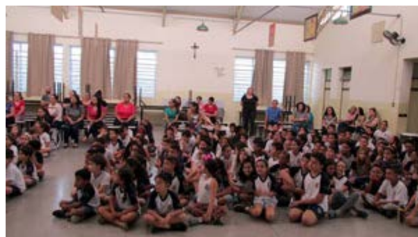
Parents heard about the importance of 'time together'