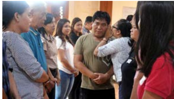
Whispering values to another in the Tunnel of Love activity