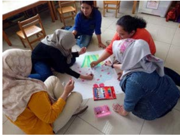
Everyone's favourite activity: Making a World Peace Cake!