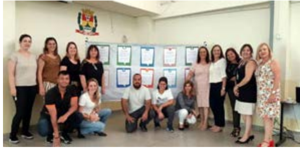
The Brazil LVE team with school management and teachers