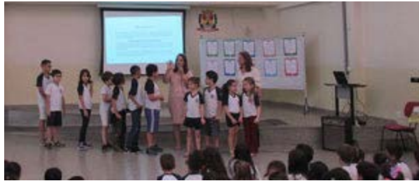
What value do you remember having experienced?