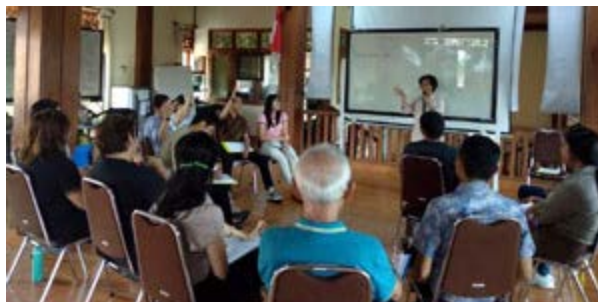
Karuna Bali's representative to ALIVE opens the workshop

A successful LVE Workshop for Educators was conducted by Karuna Bali's Long-Life Learning (CL3) team in Ubud, Bali. The workshop was attended by 16 participants including representatives of organisations such as ISCO Foundation, PUSPADI Bali and Kasih Peduli Anak. This experiential and interactive workshop comprised 16 hours of core sessions with a focus on the skills to create a values-based atmosphere that participants can then apply in their daily lives.