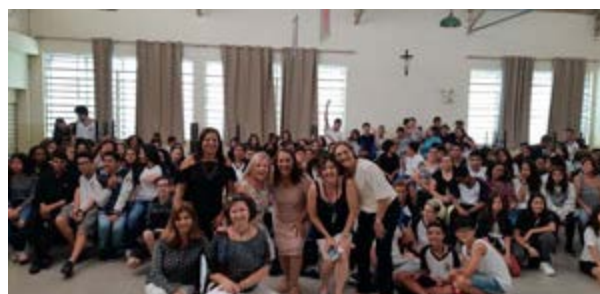
Living by a culture of peace