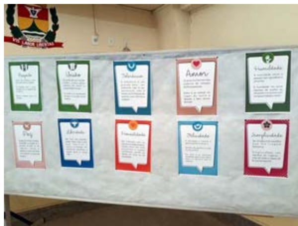
Value chart made by students and teachers