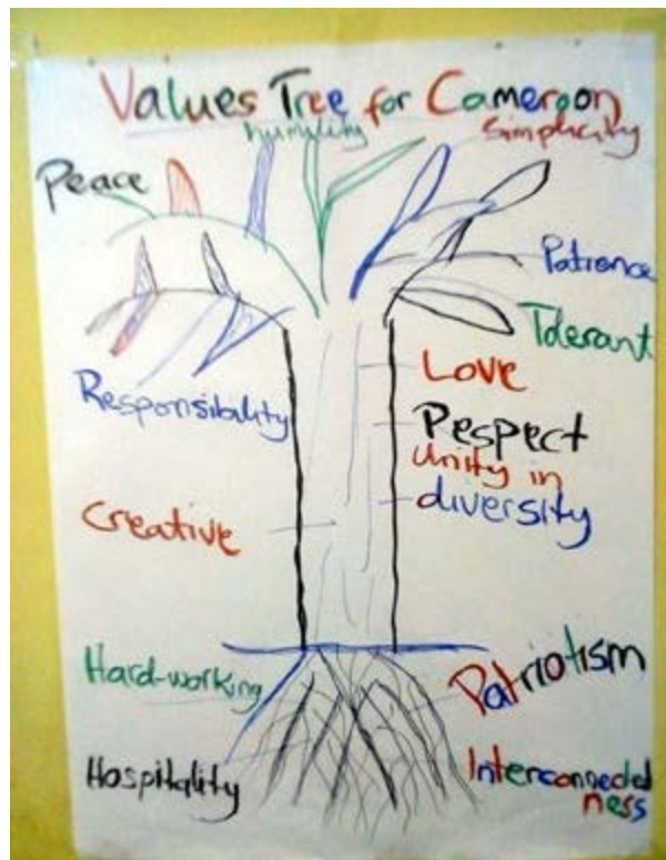
Tree of Values

the group. After this first exercise, participants were asked to draw a value tree for their school and then brainstorm on the values of Cameroon. Tellingly, participants refused to contribute, saying we don't have values in Cameroon. After much effort, finally we came out with something.