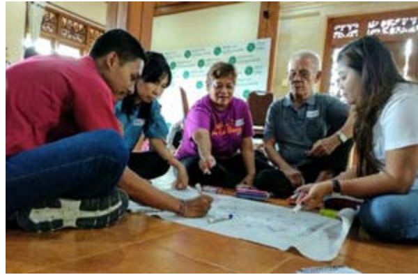
Sharing thoughts about values made for a happy small group discussion